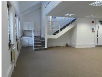
First floor offices