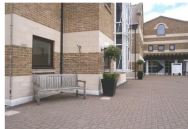
Shared landscaped forecourt